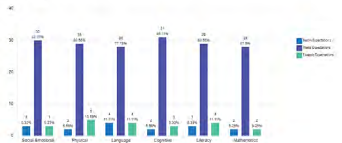
New Hampshire Department of ED - Belknap-Merrimack Head Start Winter 2021/2022 - Widely Held Expectations